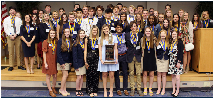
TCCHS FBLA celebrates its ninth consecutive Georgia FBLA Region One championship.

For the ninth consecutive year, the Thomas County Central High School Future Business Leaders of America chapter is the Georgia FBLA Region 1 champ.